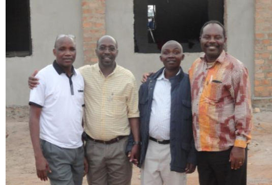
Some members of AfMA at the PT Center

For July, we hosted two major events – members of the Africa Missions Association (AfMA) from various African countries (Ghana, Nigeria, Burundi and Uganda) and a Biblical Preachers' Conference 2014. Both events went well as assessed along good planning and forecast for AfMA and great learning during the conference.