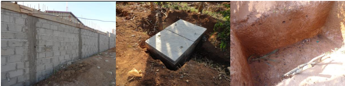
A Retainer Wall, A man-hole and the septic tank (still under construction)

All major work on plumbing has been done including laying of main pipes for septic tank, soak pit and building of 21 man-holes along the way down. What remains are inside fixtures that will make the toilet and bathroom fully functional.