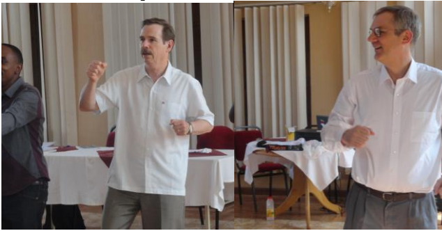
And as good missionaries, they also adjusted well to the African dance rhythm with real strokes!!

Within Africa's typical fragments of tribes and ethnic settings where the church looks like the tribe, there is now a felt challenge and readiness for the church at least in Uganda, to break ground in crossing cultures for Gospel work.