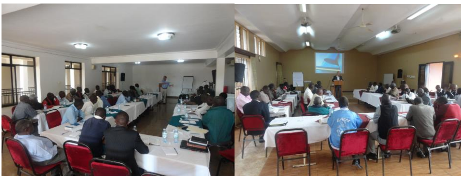
The sitting arrangement for our training sessions