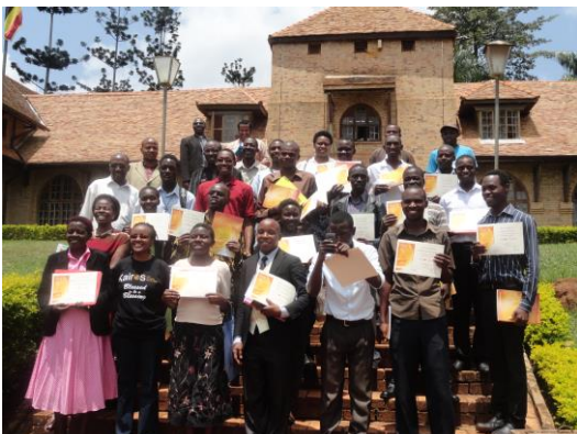
Left: Participants of the Kairos Course display their certificates upon completion of the course on Friday August 29 th