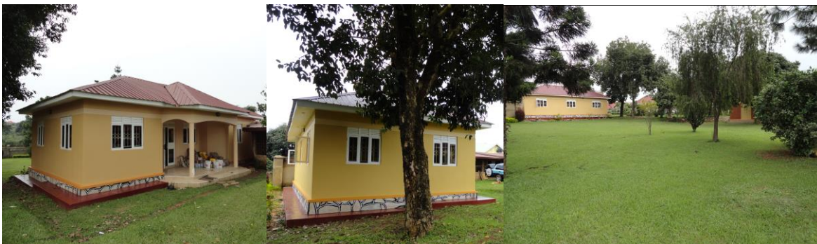
The PT Office

All ministry planning and much of the implementation still take place at the PT Office right on our home premises. On Monday there are counseling sessions; on Tuesday evening there is a prayer meeting; On Wednesday there is an apprenticeship meeting for Berea men - to develop preachers and leaders; on some Fridays there is Berea ministry planning meetings; on Saturday there is choir practice, men's monthly meetings, youth activities that take advantage of large compound and overnight prayer meetings.