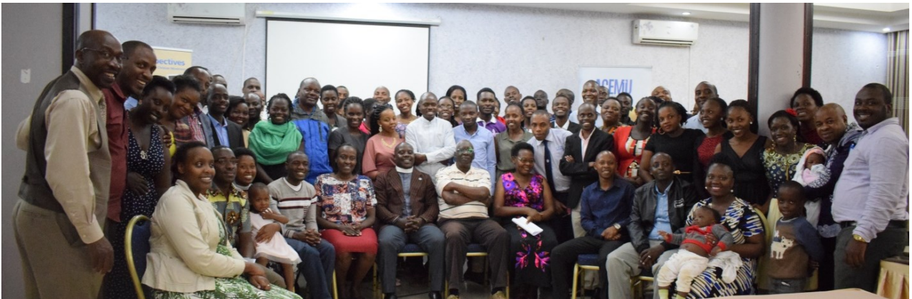
Professional workers' Reformation Dinner at Oxford Hotel in Mbarara

Christians were reminded that if doctrine is the structural integrity of the Christian faith, then preaching remains its expression, at least in propositional form. The Church's need for ongoing reform is what compels us to examine how the Church proclaims and responds to sound doctrine in our day.