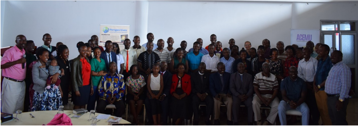
Reformation Commemoration Breakfast 2018 Participants in Mbarara

Christians were reminded that if doctrine is the structural integrity of the Christian faith, then preaching remains its expression, at least in propositional form. The Church's need for ongoing reform is what compels us to examine how the Church proclaims and responds to sound doctrine in our day.