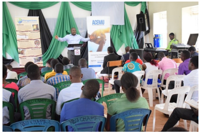
Some students publicly placed their faith in the Lord Jesus Christ at Ndejje University in Luwero, during Reformation Commemoration