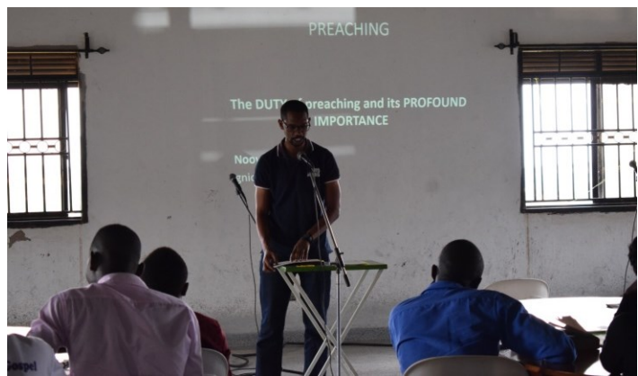
In small groups as well as question and answer sessions, students sought to grasp a human link from generation to generation, in light of God's purposes and plans as they unfold in Ezra's time or the Protestant Reformation of the 16 th century.