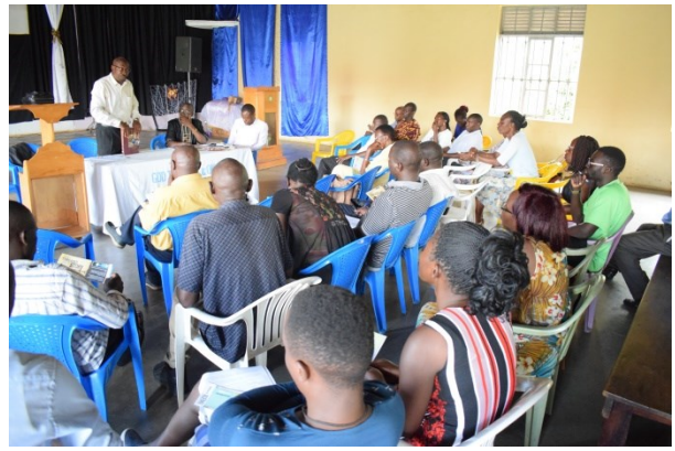
Engaging Students and Pastors during the Reformation Commemoration in Mbale